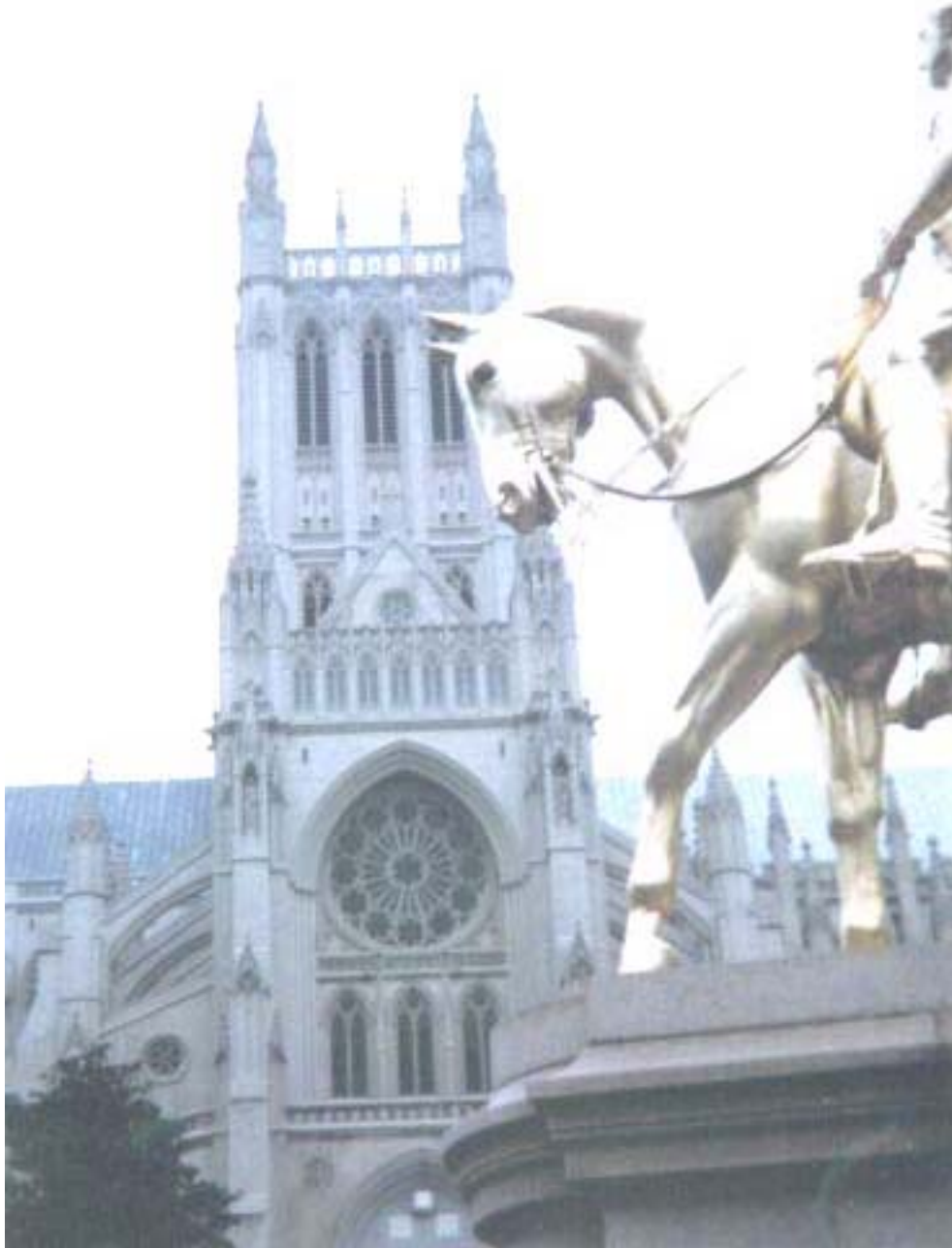
“Gloria In Excelsis” Tower of National Cathedral and President George Washington on Horseback at Mt. St. Albans (Washington D.C. April 1969)

To Hear or Download Autumn Canticle : Left Click on “National Cathedral” photo below (scroll past the photo for song lyrics and more)